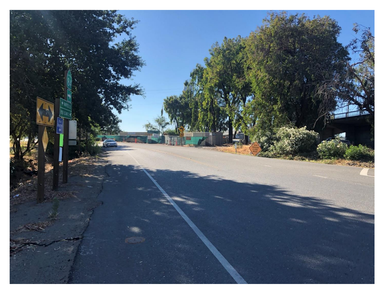
Figure 10: N Front St & SR84, South Approach