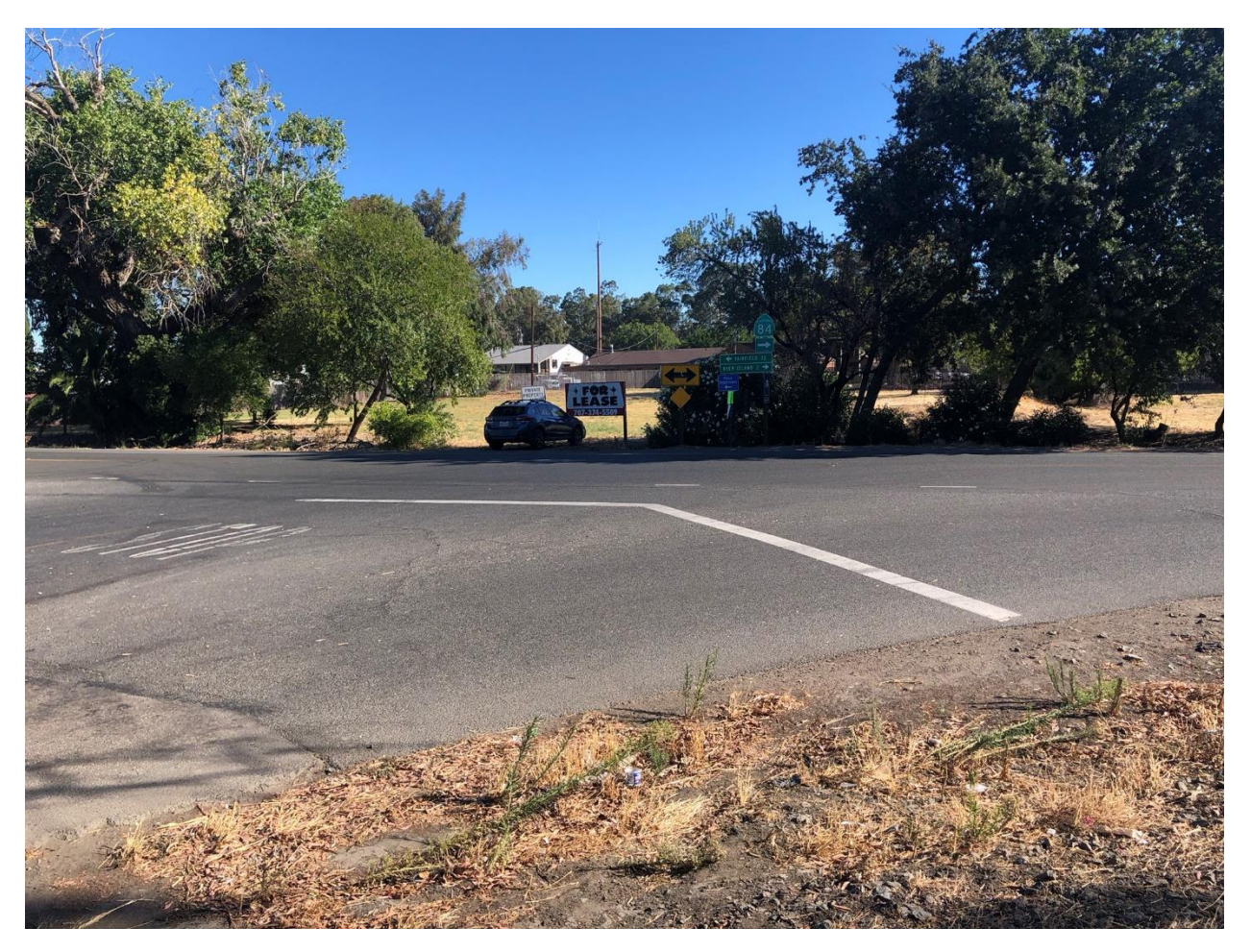
Figure 7: N Front St & SR84, Facing East