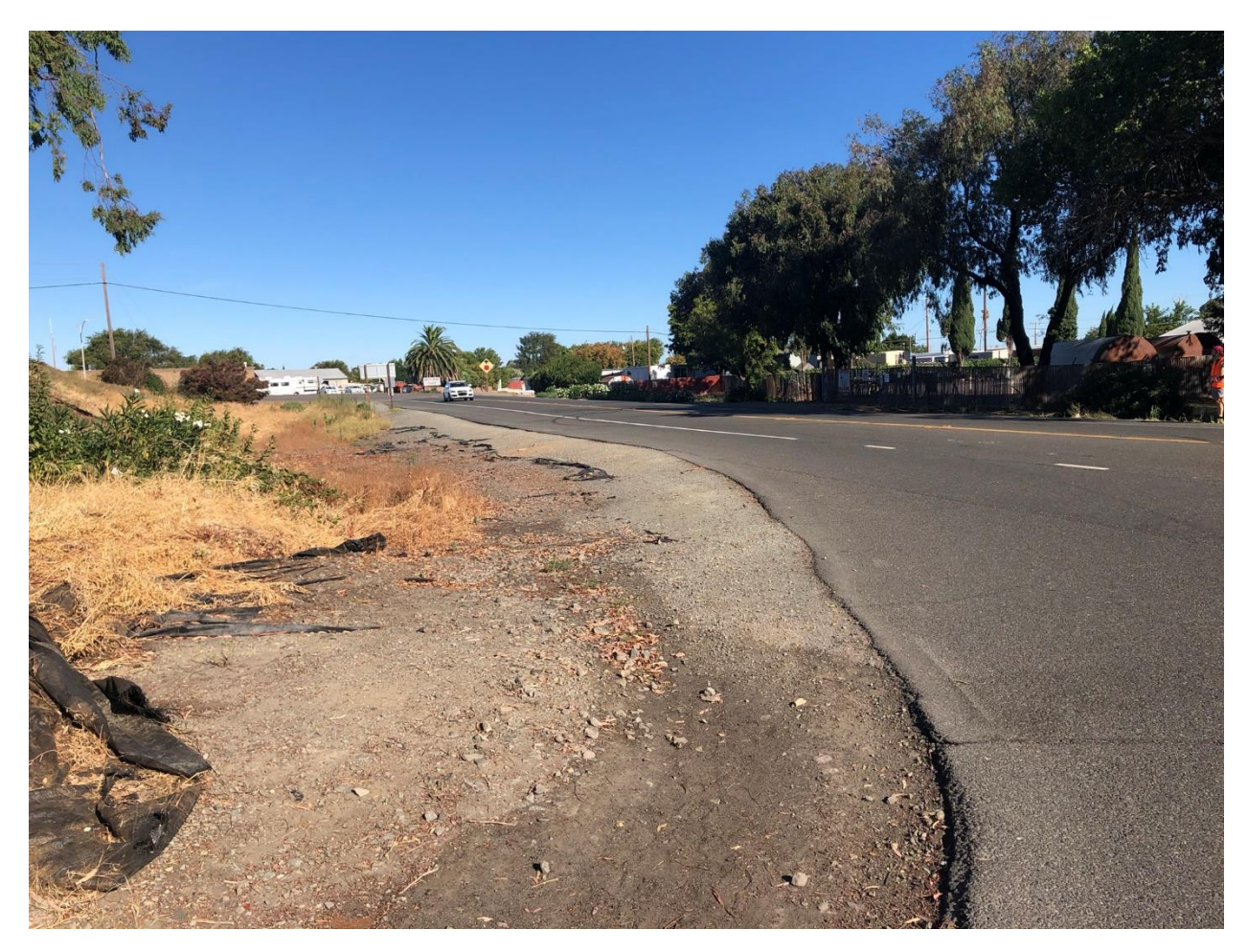
Figure 12: N Front St & SR84, North Approach (2)