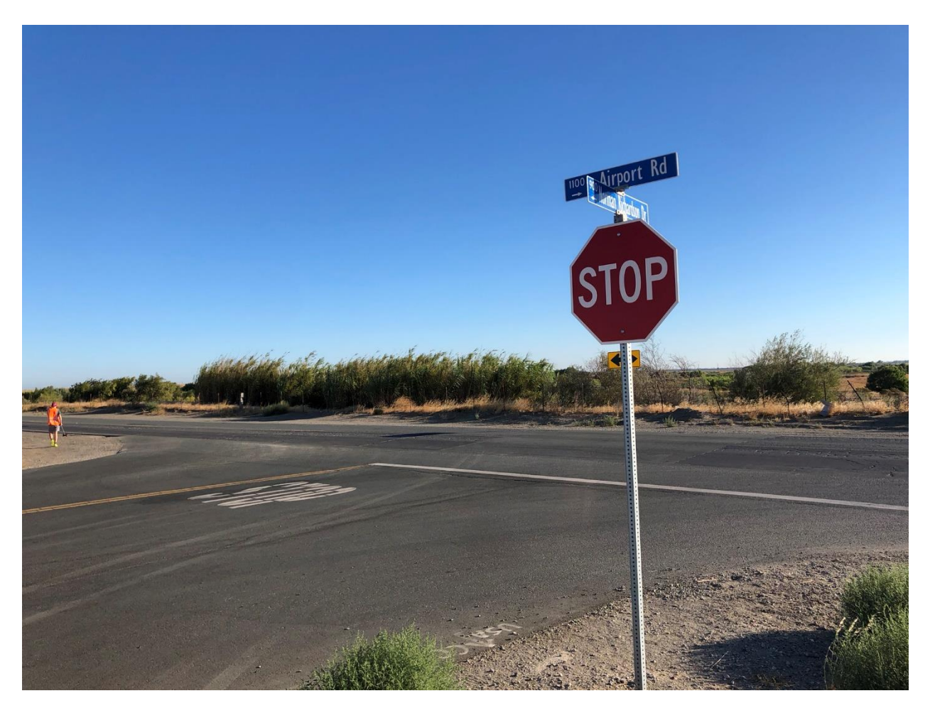
Figure 4: Airport Road and Norman Richards Drive