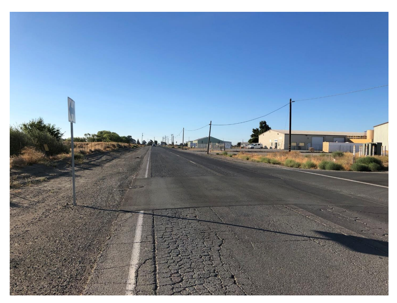
Figure 6: Airport Road and Norman Richards Drive, South Approach