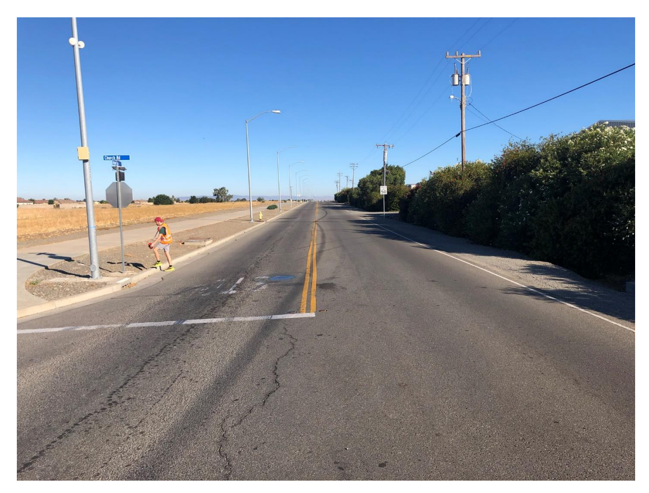
Figure 2: Airport Road & Church Road, North Approach