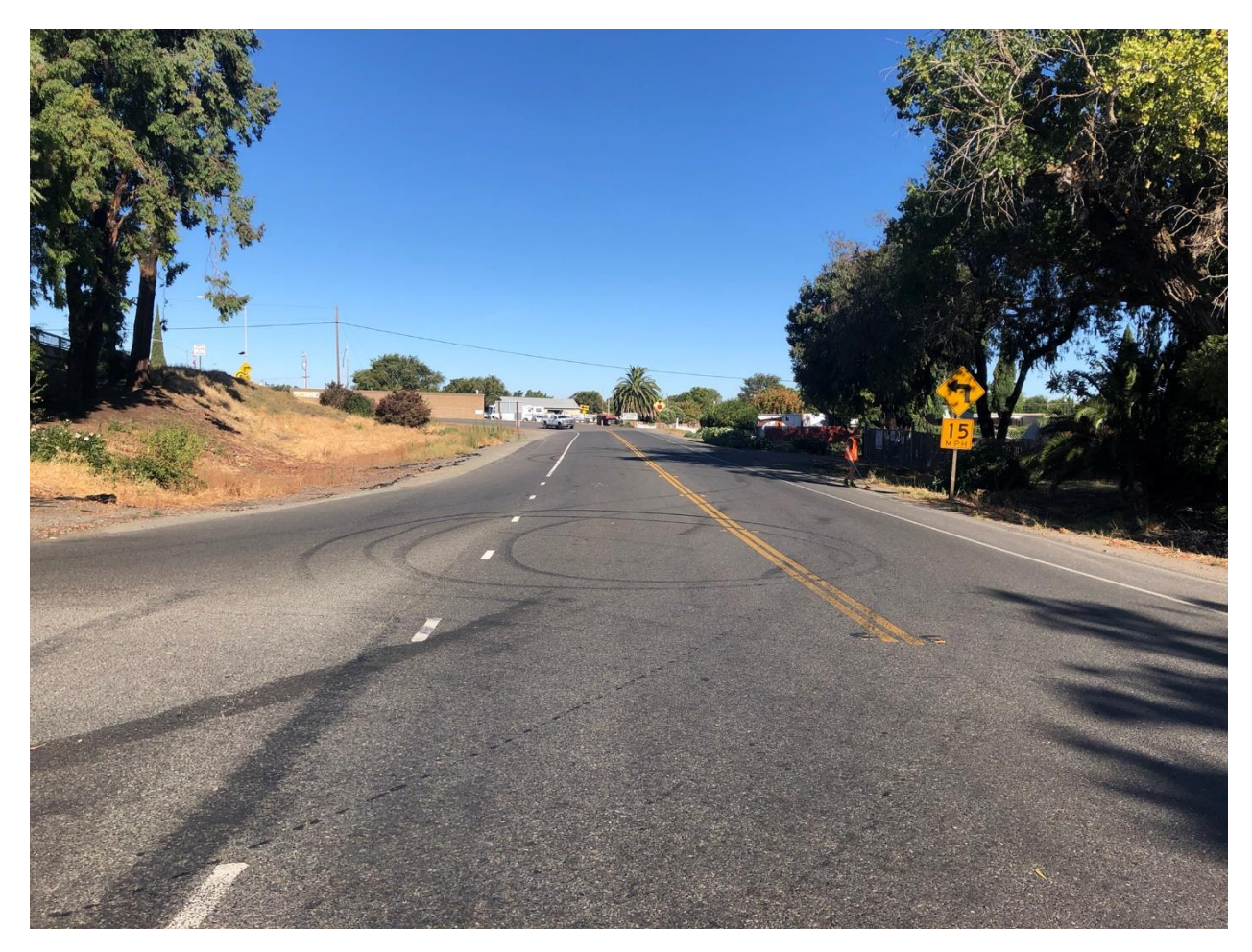
Figure 11: N Front St & SR84, North Approach (1)