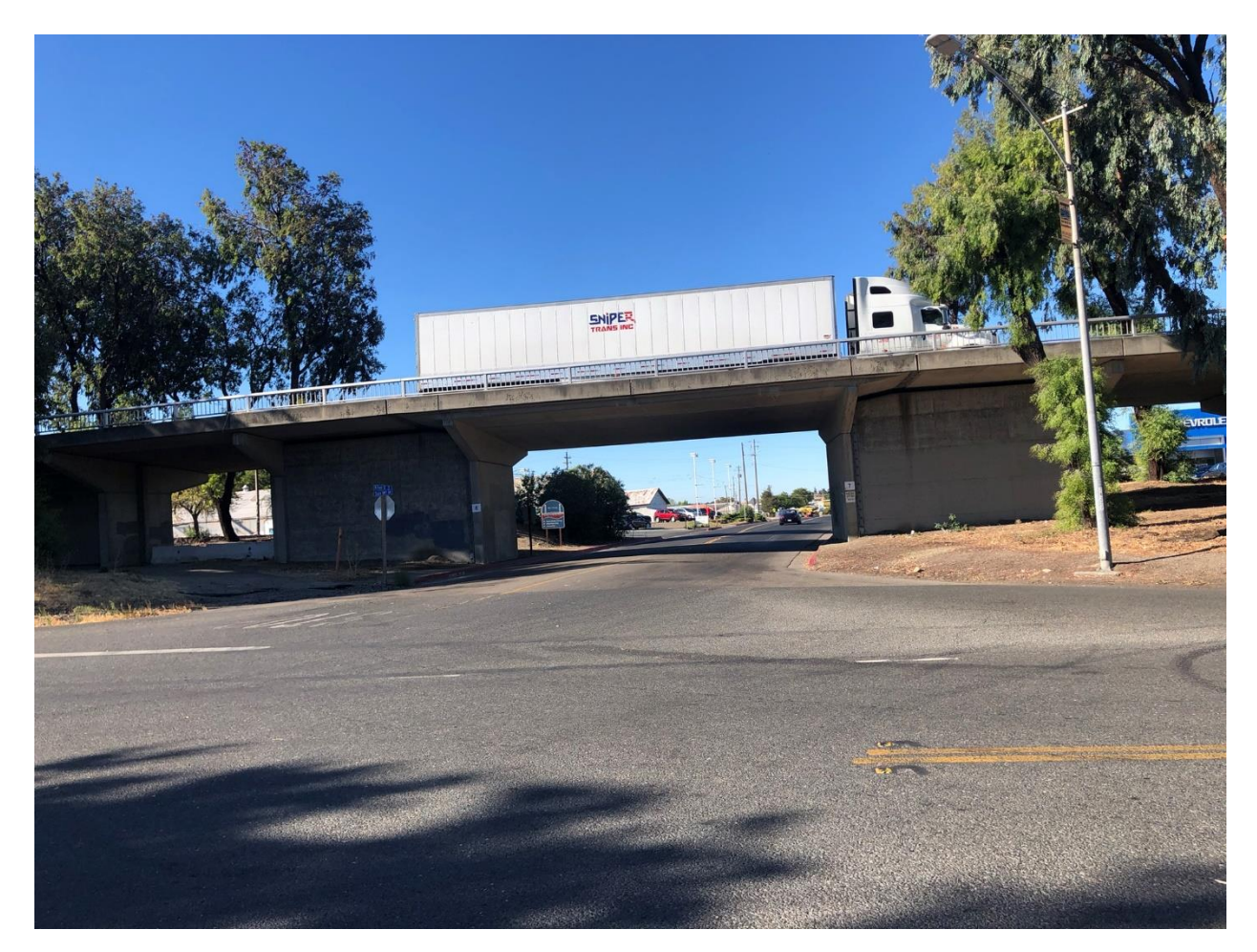
Figure 8: N Front St & SR84, West Approach (1)