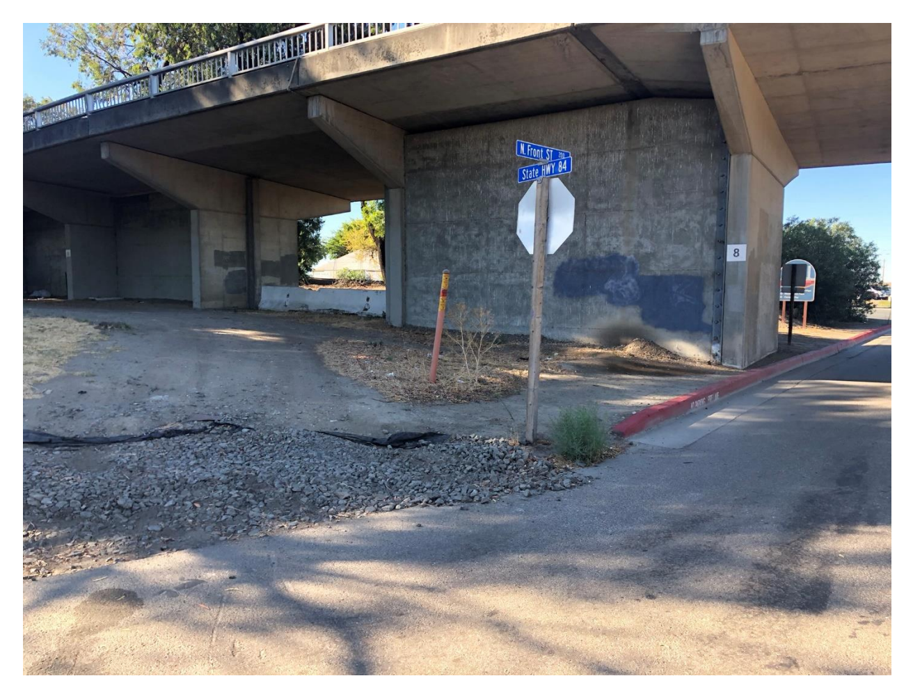
Figure 9: N Front St & SR84, West Approach (2)