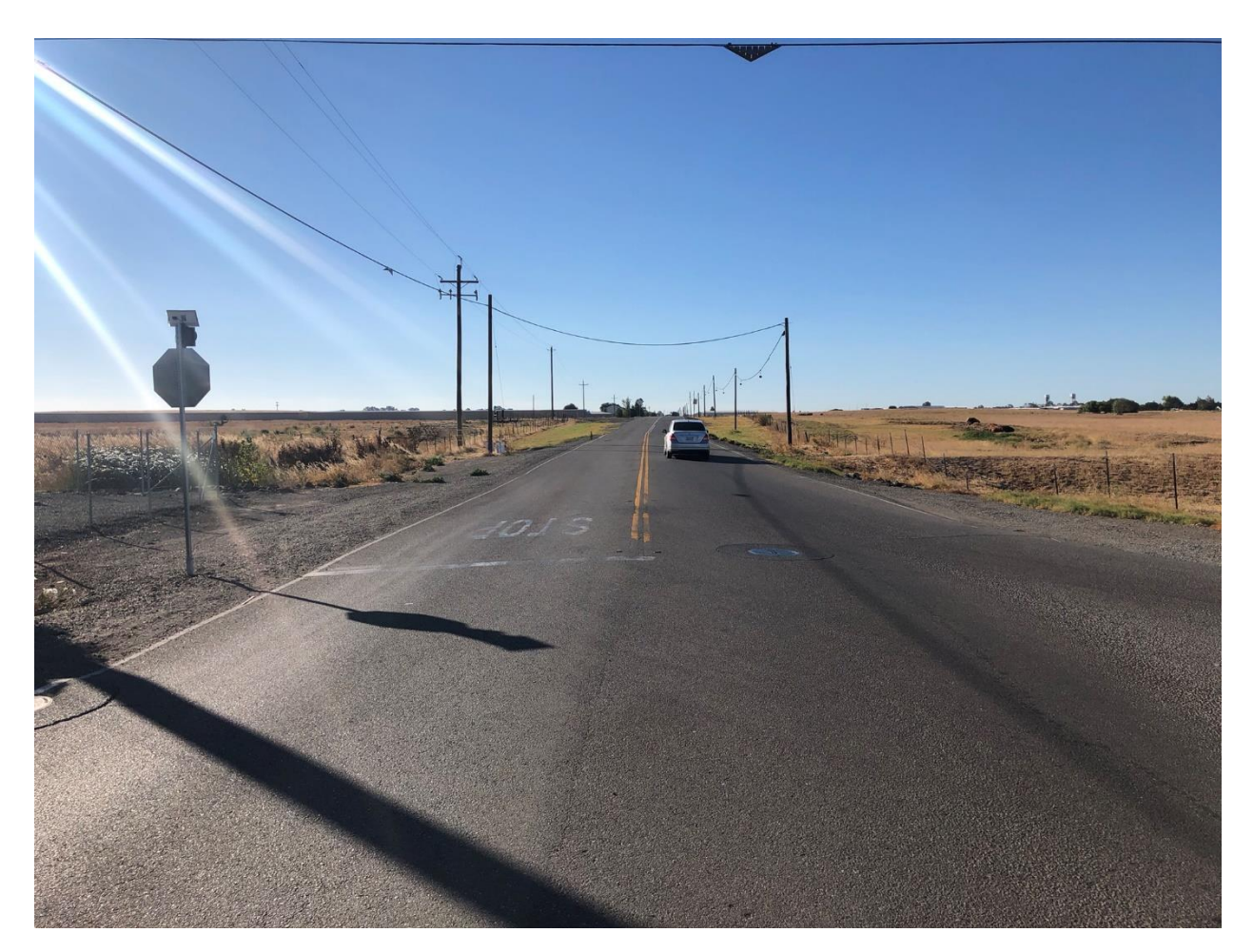
Figure 3: Airport Road and Church Road, South Approach