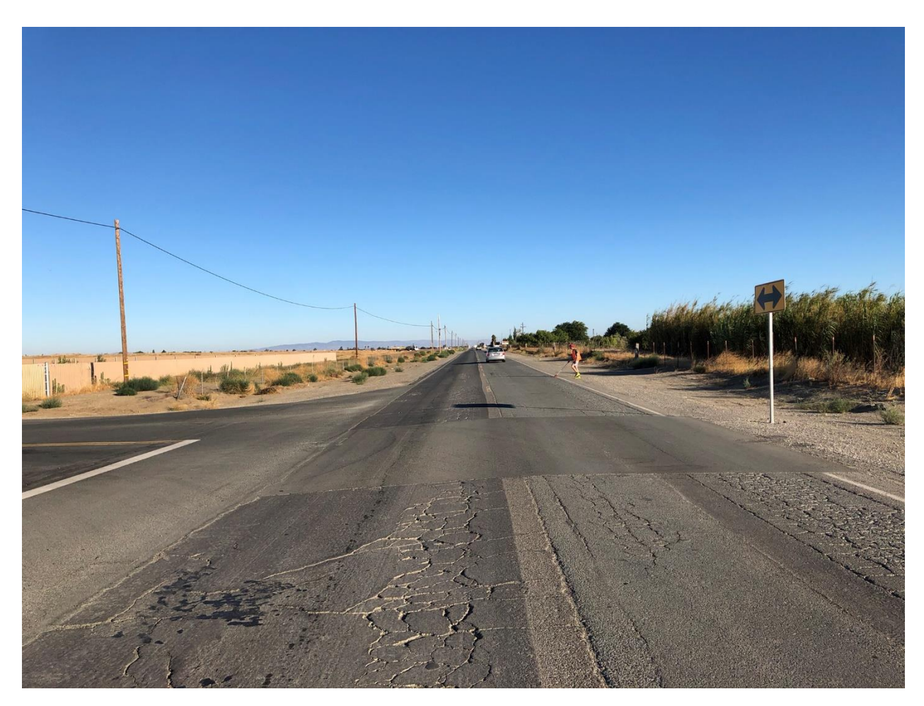
Figure 5: Airport Road & Norman Richards Drive, North Approach