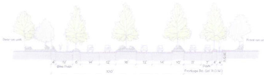
Major Arterial Street (100' R.O.W.)